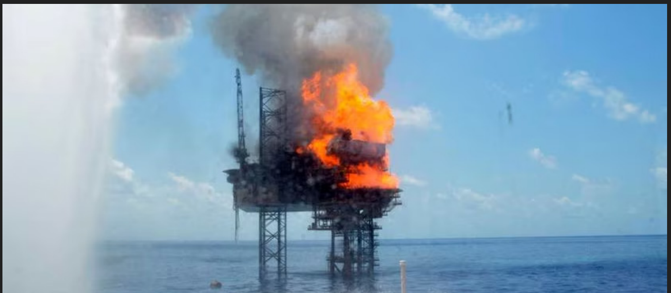
Fire at the West Atlas rig and Montara well head

A ruptured gas pipeline at Apache Energy's facility causes an explosion, sparking an energy shortage in WA and costing the state's economy billions.