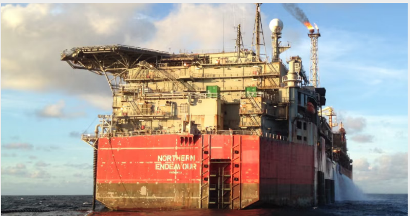
The Northern Endeavour, which became the responsibility of the federal government after its former owner went into liquidation

Act now to reject the Burrup Hub and get Tanya Plibersek to do the same.