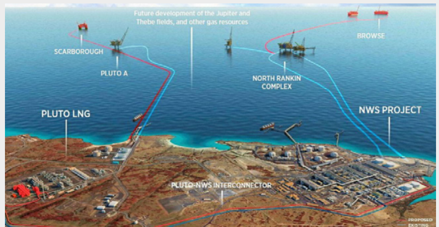
Woodside’s Scarborough development plans

Act now to reject the Burrup Hub and get Tanya Plibersek to do the same.