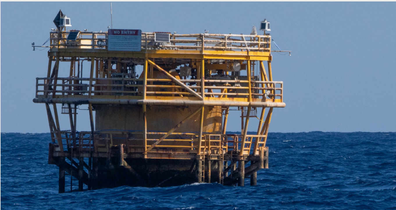
Woodside's toxic, discarded oil tower near Ningaloo Reef and Exmouth Gulf, Western Australia

Act now to reject the Burrup Hub and get Tanya Plibersek to do the same.