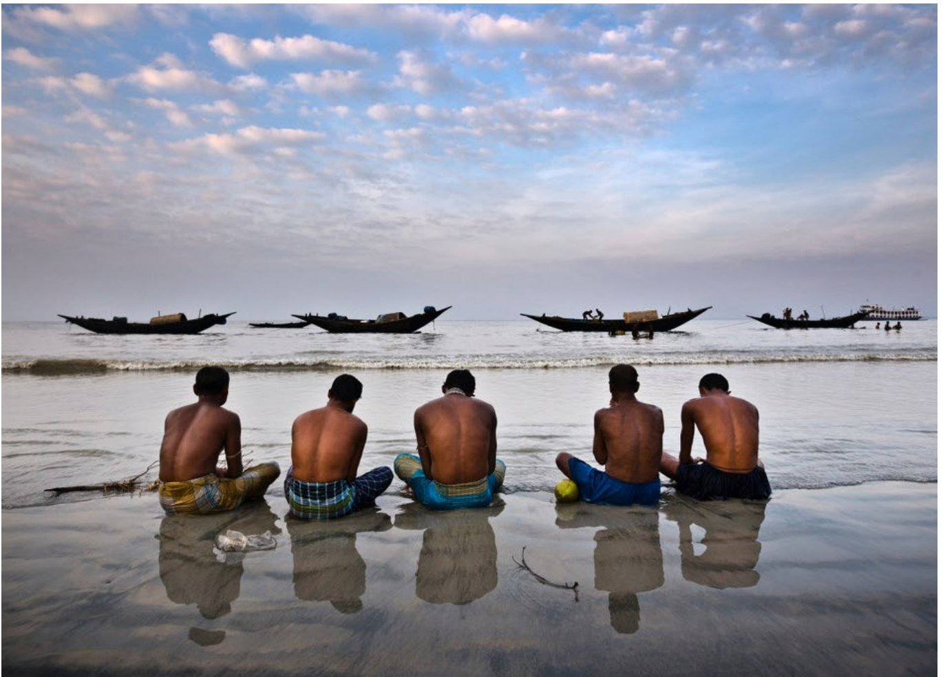
A row of men seated on the wet sand at low tide, praying for a benevolent sea, before going fishing.

By implementing some of these proposed financial sources, Australia could deliver genuinely additional, ongoing finance to address loss and damage that targets major polluting individuals and companies. These forms of finance do not place additional burdens on government budgets and align with the polluter pays principle. 148