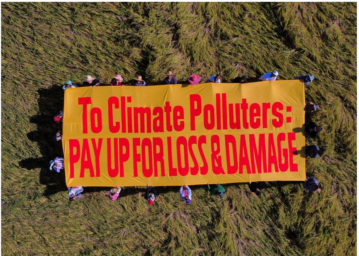
Farmers' Protest in Gerona, Philippines

At COP27, the Albanese government has a clear opportunity to show leadership by supporting the establishment of a Loss and Damage Finance Facility and committing funds.