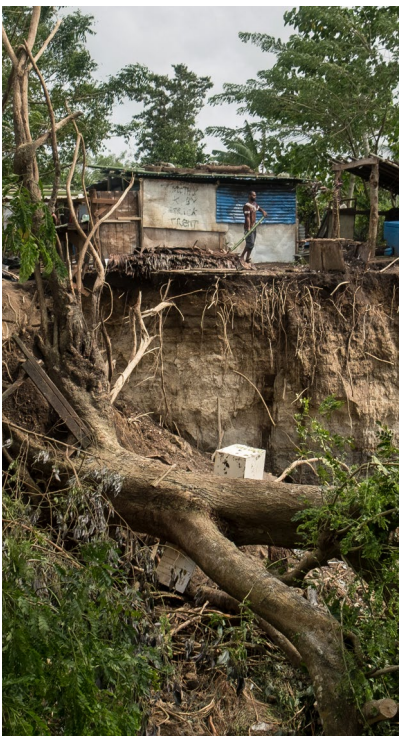
Impacts of category 4 Tropical Cyclone Donna in Vanuatu, 2017.

As a caveat, due to the complexity and intangible nature of non-economic losses and damages such as loss of life and cultural heritage, this report focuses only on the economic losses and damages that can be more readily monetarily quantified.