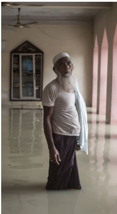
A man stands knee deep in flood water in a mosque under arches.

For example, between 2010-2020, Fiji was hit by 9 cyclones costing AUD $1.66 135 billion in losses and damages. 137 The AUD $11.6 billion spent on fossil fuel subsidies in 2021-22 could fund the redress of these damages six times over.