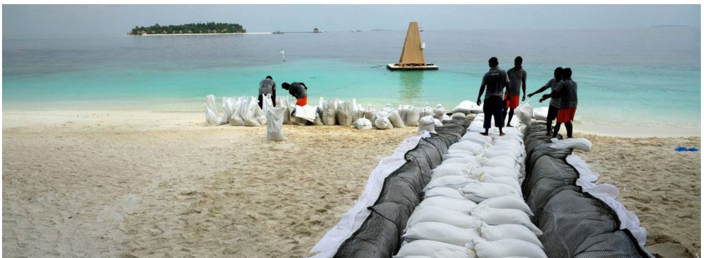
Men working on the construction of a levee with sandbags for protection against erosion in the Maldives.

To truly deliver on its promises to take strong action on climate change and support the Pacific, the Albanese Government must support the establishment of a Loss and Damage Finance Facility at COP27.