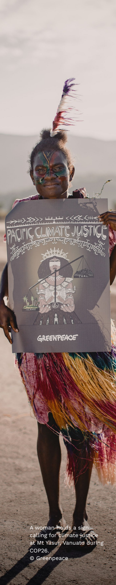
A woman holds a sign calling for climate justice at Mt Yasur, Vanuatu during COP26.