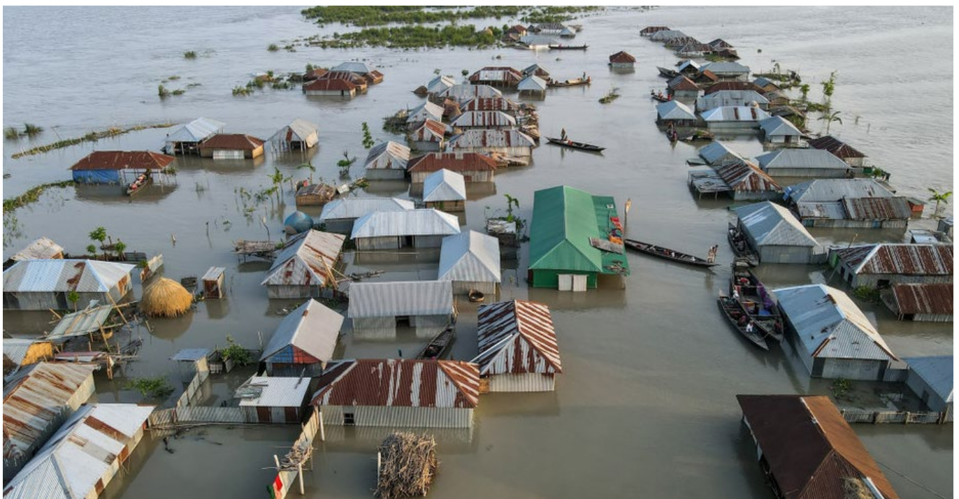
An aerial view of a village submerged in sea water.

In the lead up to COP27, loss and damage, and the delivery of funds from major polluters in the Global North to climate impacted countries in the Global South has become a top priority. This issue is of particular importance to our Pacific neighbours due to their ongoing advocacy and leadership on loss and damage finance, but also their continuing experiences of loss and damage.