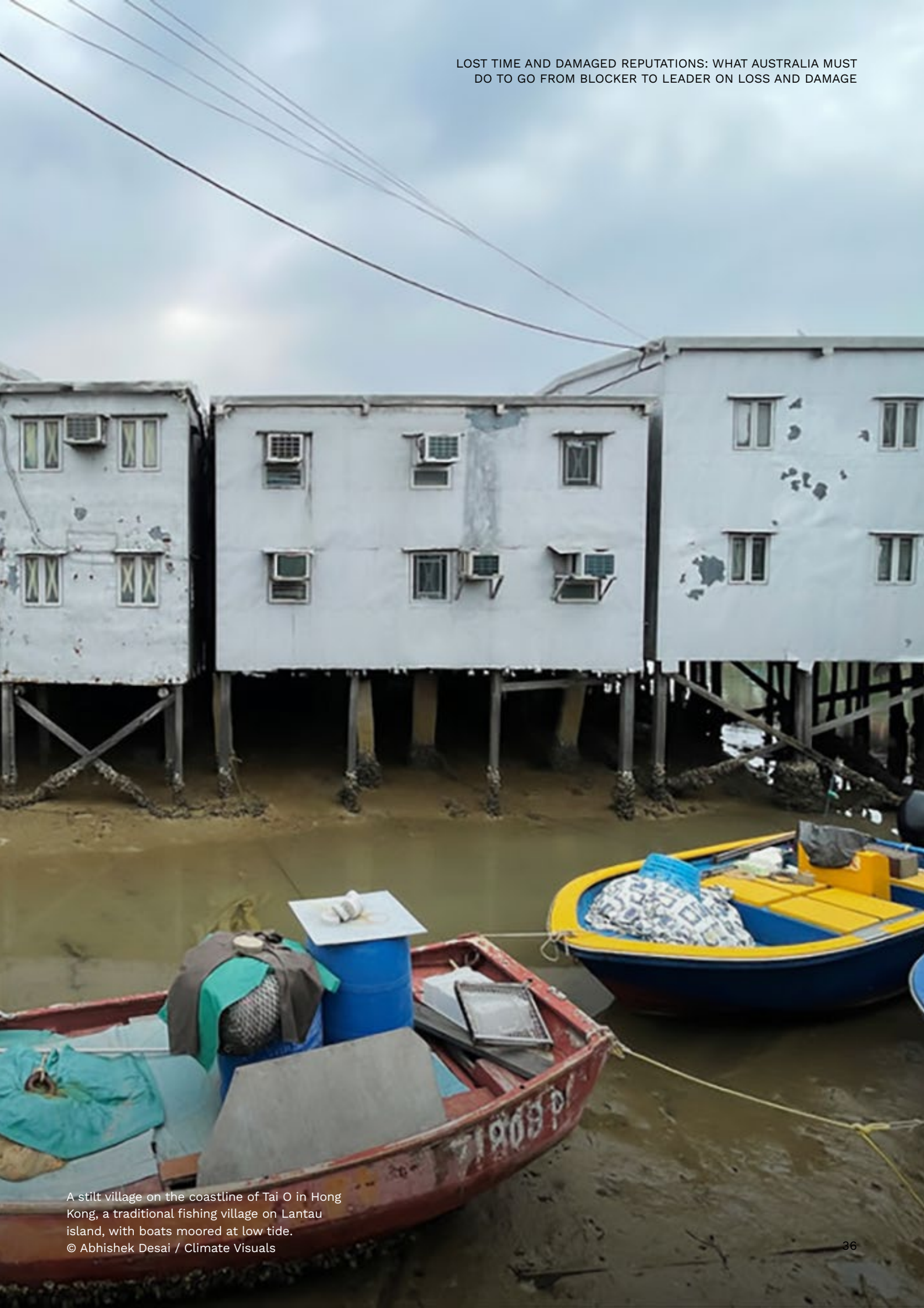
A stilt village on the coastline of Tai O in Hong Kong, a traditional fishing village on Lantau island, with boats moored at low tide.